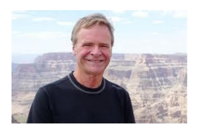
Founding Member of CRESNET