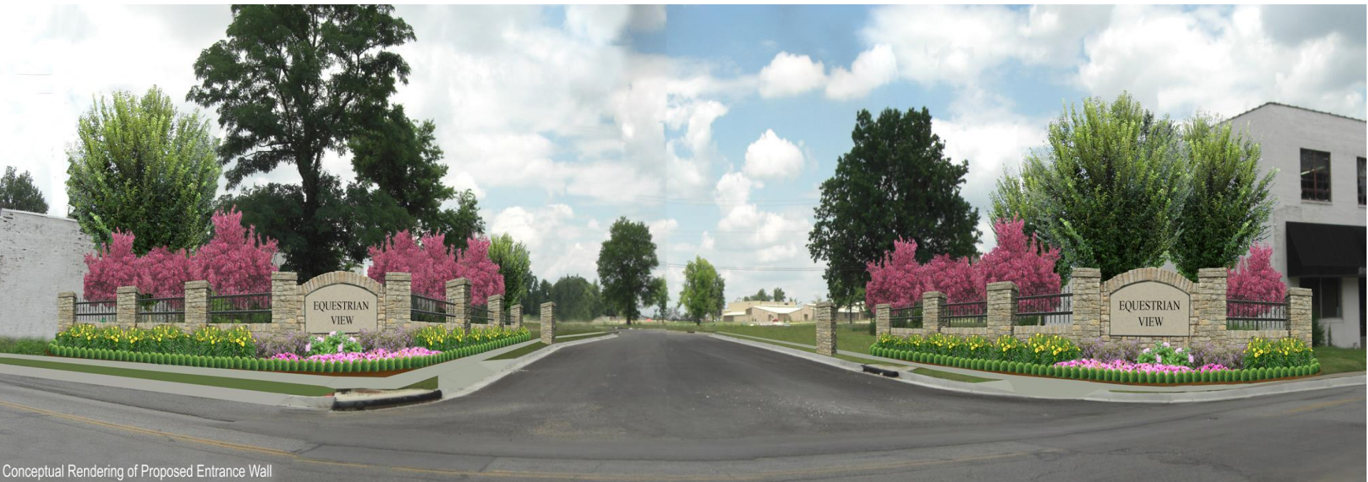
Conceptual Rendering of Proposed Entrance Wall