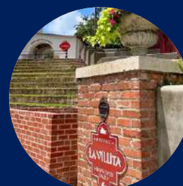
La Villita Historic Village