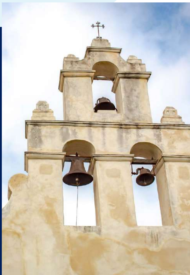
San Antonio Missions