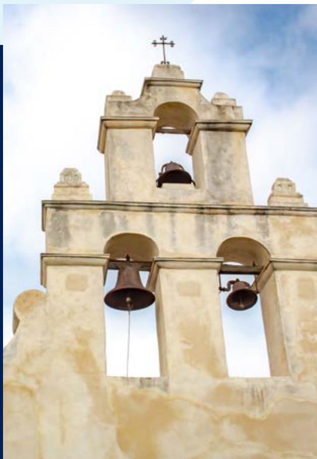
San Antonio Missions