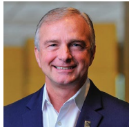
Dominic Sims, CEO, International Code Council

International Code Council (ICC) Chief Executive Dominic Sims will cover how the ICC is leading the path to net-zero carbon homes and how the International Energy Conservation Code (IECC) is moving to achieve this goal. The ICC is the leading global source of model codes and standards and building safety solutions that include product evaluation, accreditation, technology, training, and certification.